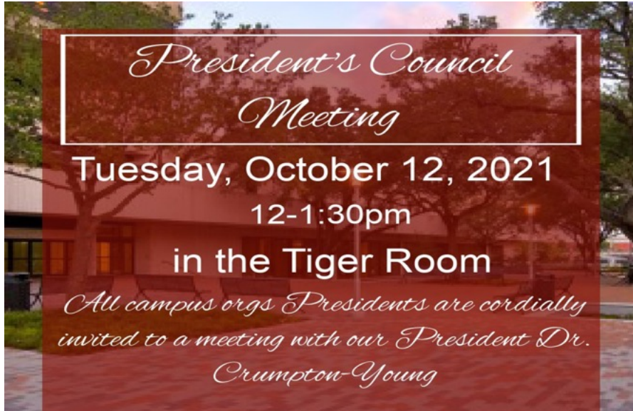
Figure 8. Chapter's president participated in the TSU President's Council Meetings