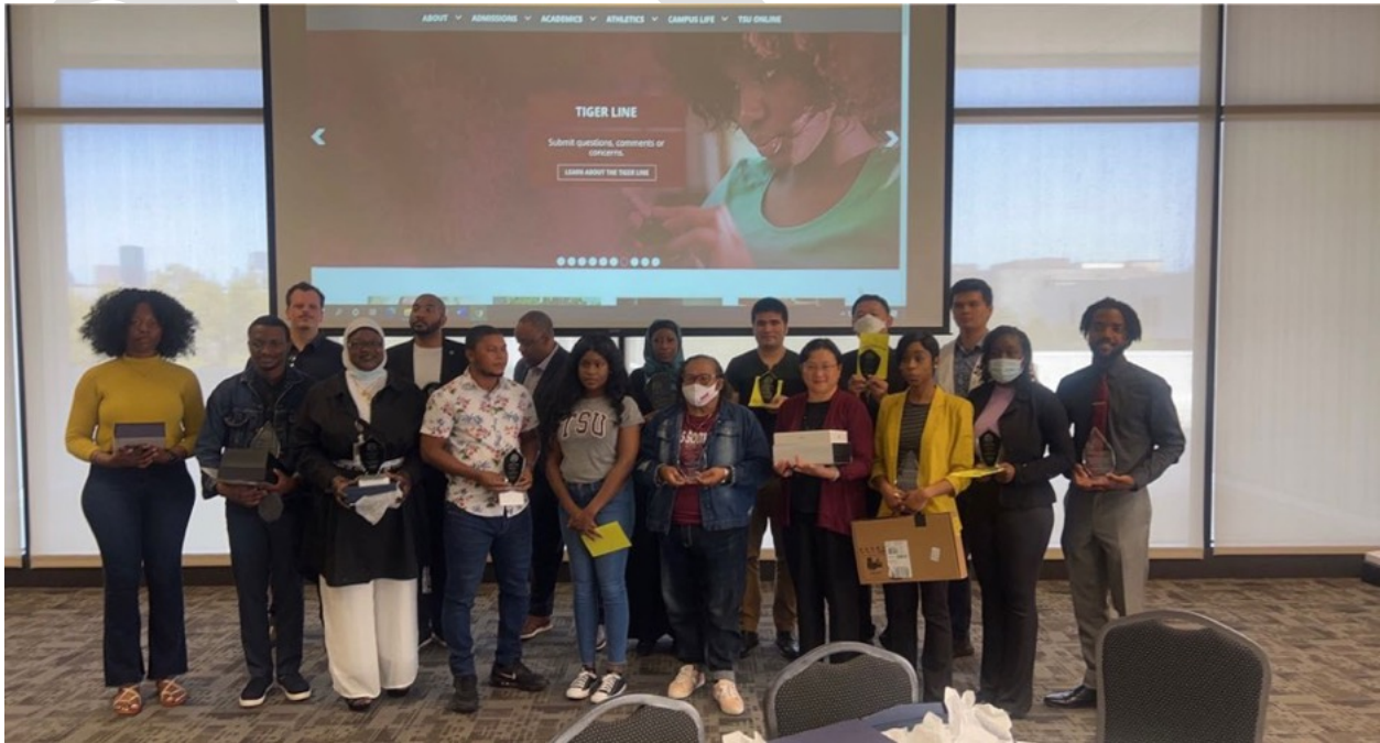
Figure 4. TSU Research Week - Winners