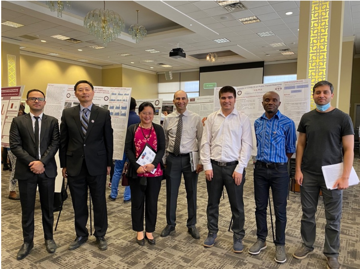
Figure 3. Chapter members participated in the TSU Research Week