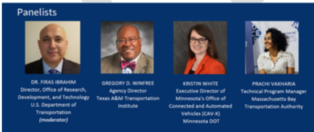
Figure 9. Chapter members participated in the UTC webinar

On October 07, 2021, the UTC conducted a virtual seminar on Zoom with the theme of Automated Vehicles. ITS TSU Student Chapter organized student members to participate in this webinar. The panelists deeply talked about the recent development of Automated Vehicles in the U.S. In the end, the ITS TSU students asked several questions from the panelists.