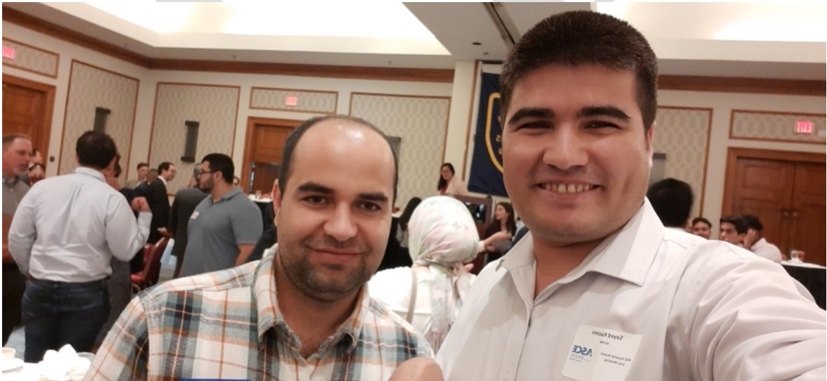
Figure 2. Chapter members participated ASCE Houston Meeting